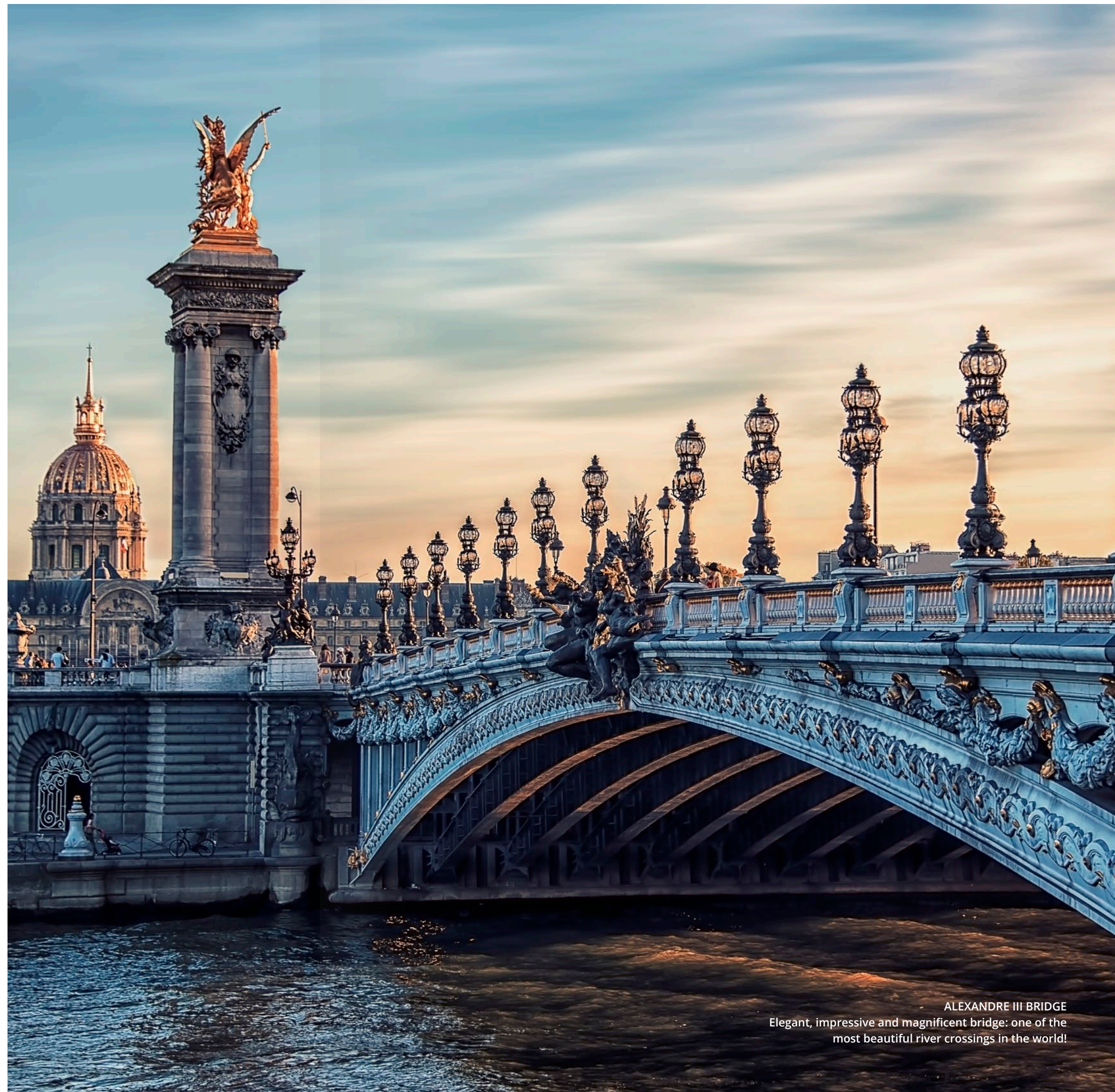
ALEXANDRE III BRIDGE Elegant, impressive and magnificent bridge: one of the most beautiful river crossings in the world!

This edition of the Conference will also feature some of the most beneficial training courses, world-class speakers, and incredible networking opportunities.