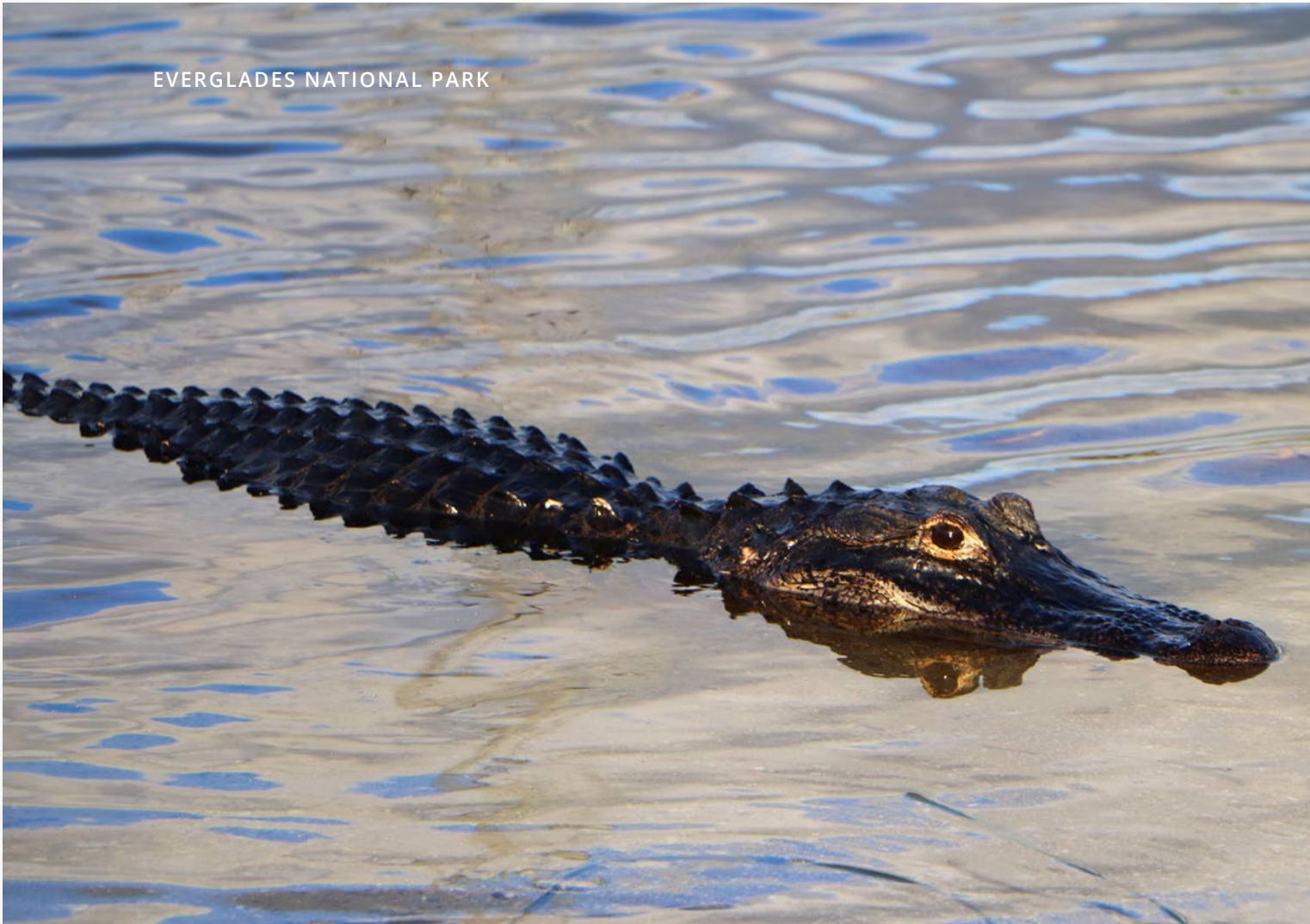
EVERGLADES NATIONAL PARK