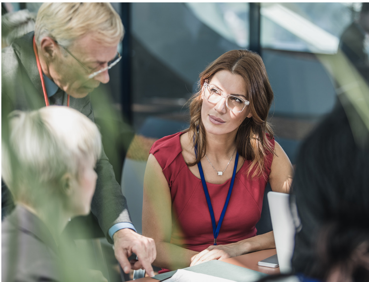
Example: PECB certification requirements for Risk Management Master